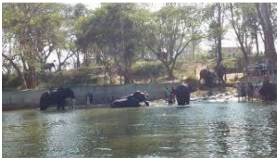
Dubare Elephant Camp

Return to the hotel. After lunch visit to Spice Plantation and farms. Night halt at Madikeri.