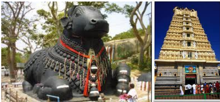
Big Nandi, Lord Shiva's mount and Sri Chamundeshwari Temple

After brunch departure to Mysore (45kms- 1 hr). We will visit Chamundi Hill, Chamundeshwari Temple and Mysore Maharaja Palace. Mysore is the 2 nd largest city of state Karnatak. The city is nestled at the base of Chamundi Hill. Shri Chamundeshwari Temple, on the crest of the hill, dates to the 11 th century. Near the temple is statue of Mahishasura, the demon slayed by the goddess Chamundeshwari. Half way up the stone steps is the 4.8 meter high monolith of Big Nandi, Lord Shiva's mount.