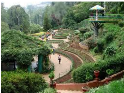
Botanical Garden, Ooty