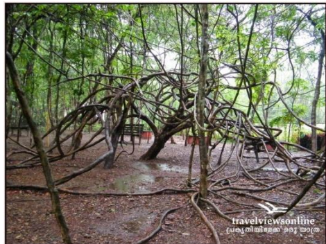
Nilambur Teak Museum

After breakfast visit to Heliconia farms (Pics). Afternoon lunch at River Side with live cooking. Thereafter visit to Nilambur Teak Museum. (The only teak museum in the world) Night halt at Raviz Resort.