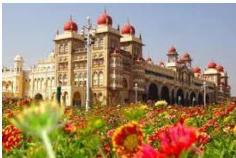
Mysore Maharaja Palace

There after proceed to Bangalore. Night halt at Bangalore.