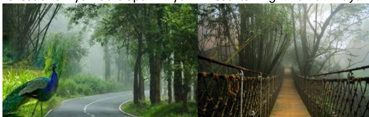
To Wayanad Hill Station

After breakfast departure to Wayanad (65 kms.- 2 hrs.). Wayanad is explicitly beautiful with mist clad mountains, intense forests and fertile green plantations. The forests of Wayanad are cosmic landmasses for animals to enjoy their natural dwelling. Snuggled amidst the Western Ghats Mountains, Wayanad is one of the exquisite hill stations of Kerala. Wayanad shelters endangered species and it has an amazing range of flora and fauna. Wildlife aficionados and nature lovers will find Wayanad wildlife sanctuaries the right place to visit. Having an influential in early human history, much numerous evidence of depicting new Stone Age civilization is seen in the Wayanad hills. Enjoy the forest and Ayurvedic Spa in Vythiri Resorts. Night halt at Wayanad.