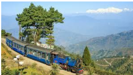
Ooty ( Oothagamandalam)

It is a collage of luscious tea gardens, hills and cliffs, forests, sporting spots, parks & gardens, lakes and waterfalls. Ooty is alluring, vibrant and mesmerizing; a haven on the hills. On the way visit Farm or Sim's Park garden in Coonoor. Check into Hotel Gem Park or similar. Evening will be at leisure. Night halt at Ooty.